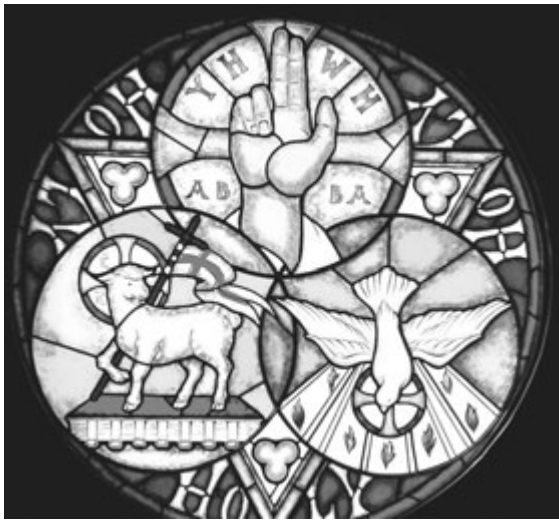
THE MOST HOLY TRINITY June 11, 2017

Today we celebrate God, the God of love, unity, and reconciliation. Our God is full of tenderness and compassion, slow to anger, rich in faithfulness. This week in what way can I share the tenderness and compassion of God with others?